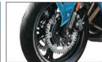
Twin 300mm front disc brakes