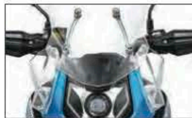
Large screen, defectors & handguards