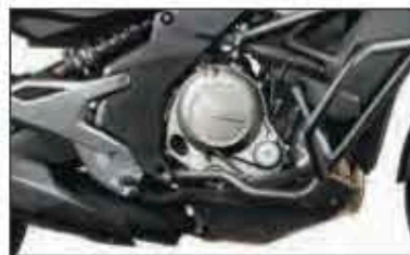
650cc parallel twin engine