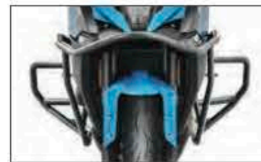
Front, side & engine crash bar set