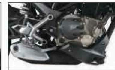
300cc, 4-valve, DOHC engine