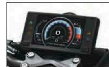
Full colour TFT display