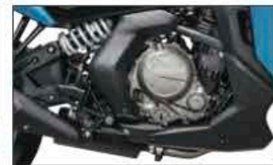
650cc parallel twin engine