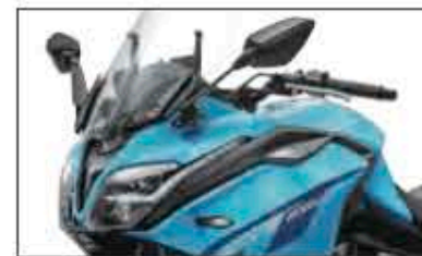
Adjustable sports windscreen