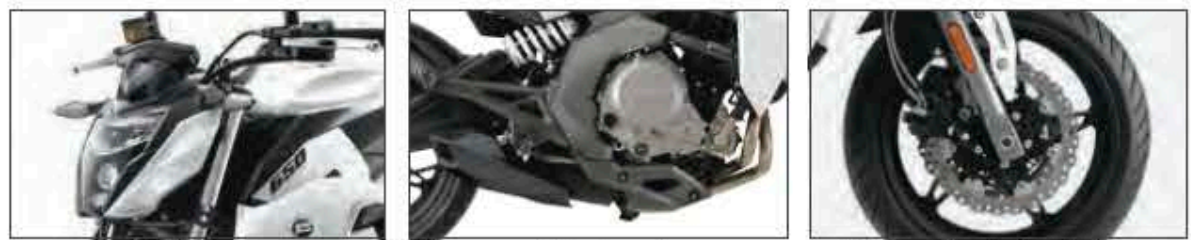
Aggressive NK styling